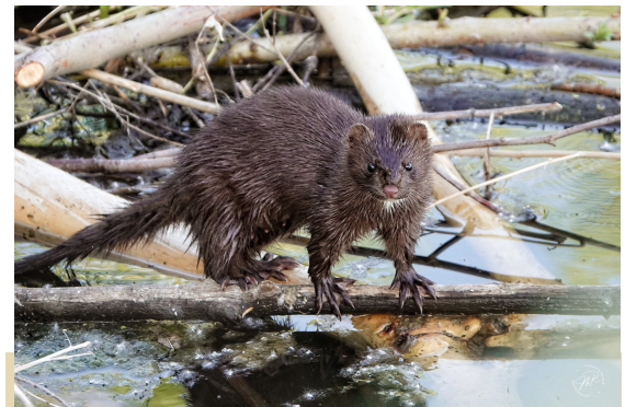
A rare sighting of an American Mink in South Platte Park.