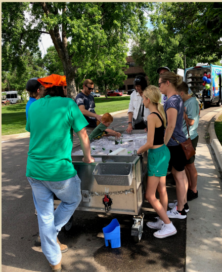
The "Express" sponsored by SMLC at the June 21st Meet Greet and Eat. The S. Platte Park naturalist staff demonstrates how flood waters change the land.

SMLC will sponsor the South Platte Park naturalist staff at the August 30 Littleton Meet Greet and Eat at Promise Park. The naturalist staff will have aquatic animals and demonstrate the value of floodplain nature in parks. We'll be there from 4 – 6 p.m. and we look forward to seeing you!